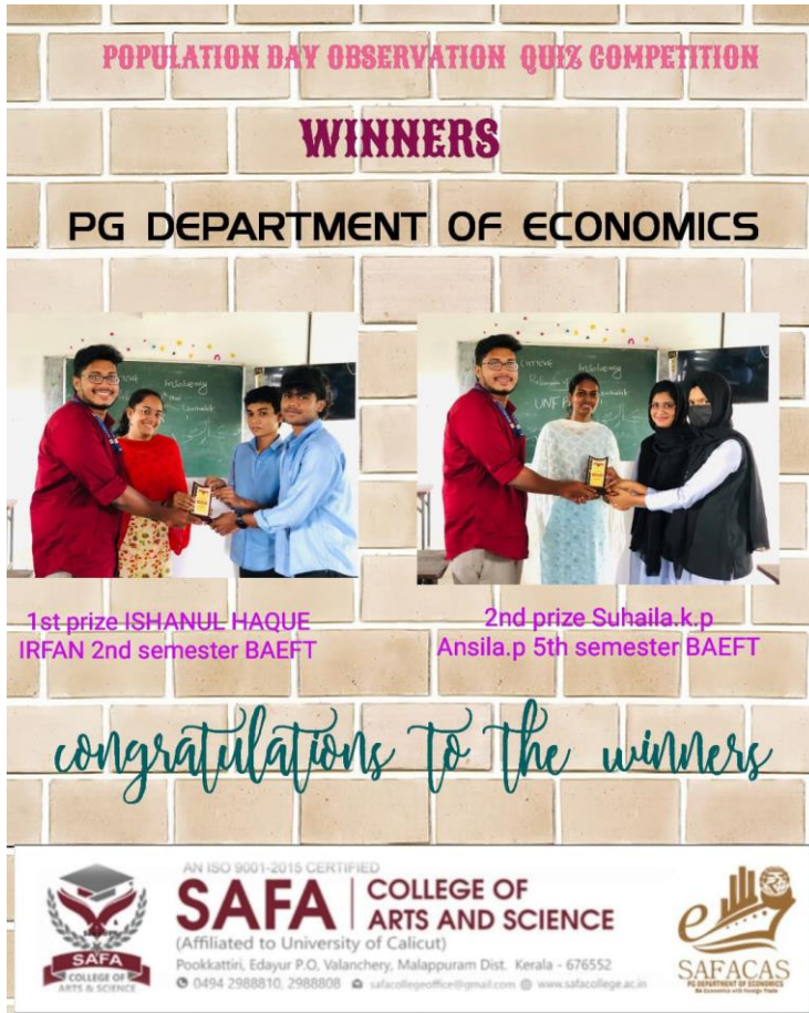
Population day quiz competition