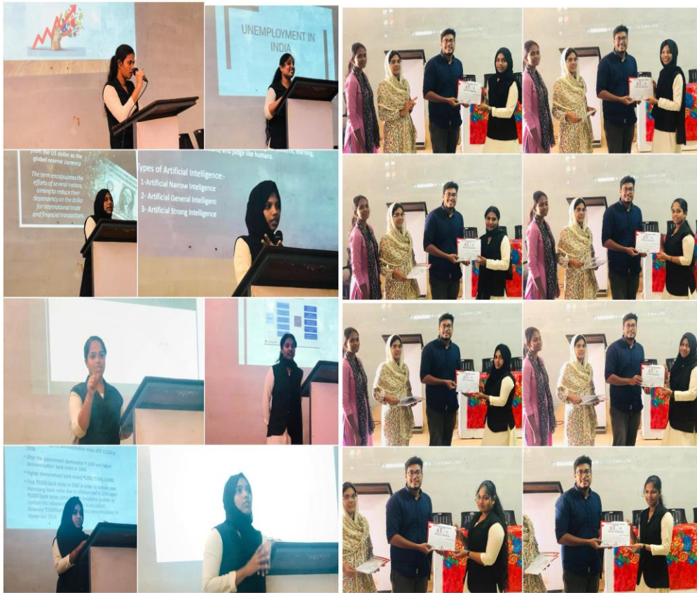
Student's Paper Presentation and Certificate Distribution