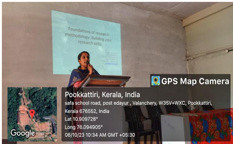
Regional Seminar on Foundations of Research Methodology: Building Your Research Skills