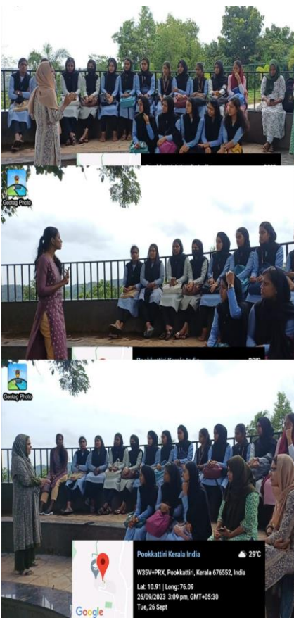
Always Deserved to be Reserved – An open Discussion on Women Reservation Bill