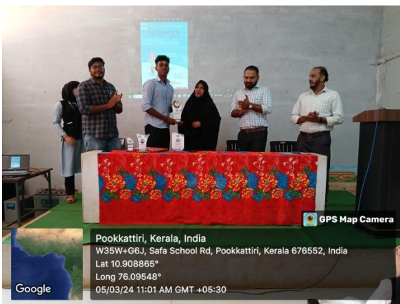
Memento Distribution to Sahad NP