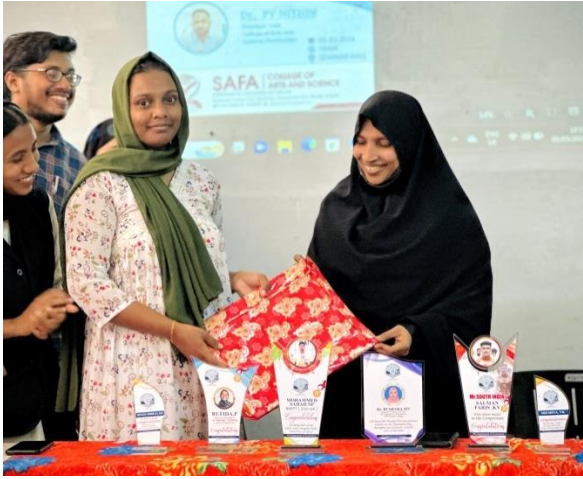
Manuscript Magazine Release