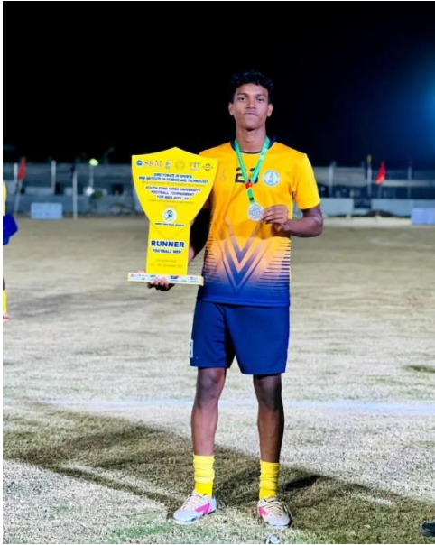
SOUTH ZONE INTER UNIVERSITY FOOTBALL