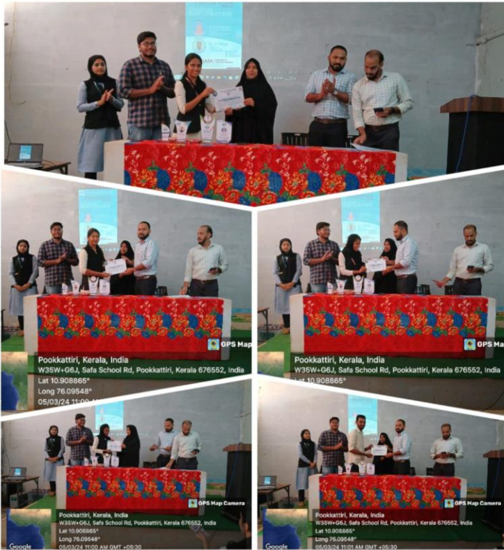
Add-On Course Certificate