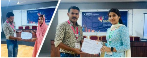
Students Paper Presentation in MESMAC