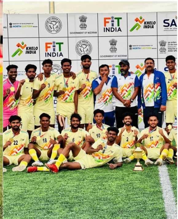
KHELO INDIA FOOTBALL – WIN THE CHAMPIONSHIP