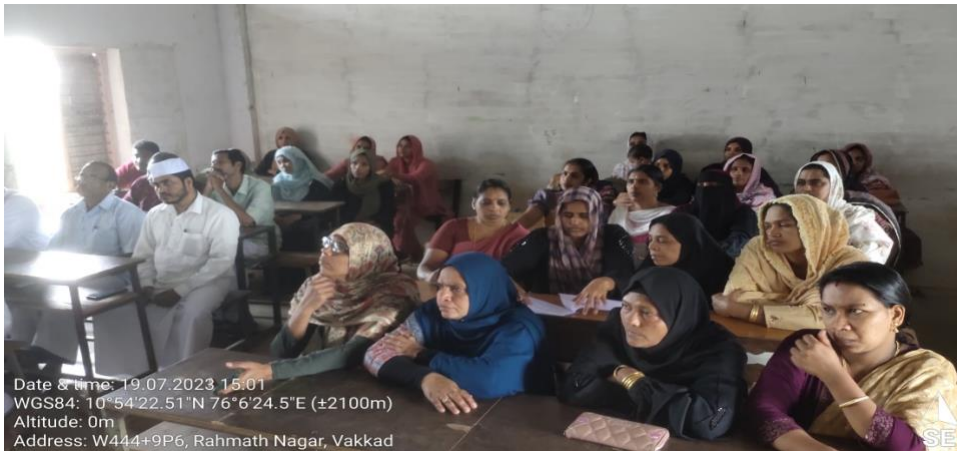
Date & time: 19.07.2023 15:01 WGS84: 10°54'22.51"N 76°6'24.5"E (±2100m) Altitude: 0m Address: W444+9P6, Rahmath Nagar, Vakkad

During the academic year 2023-24, the Parent-Teacher Association (PTA) for the Bachelor of Social Work (BSW) students held several key meetings at the beginning of each semester. The initial meeting, conducted at the start of the Fall Semester, focused on setting academic goals, reviewing curriculum changes, and establishing expectations for both students and parents. This session aimed to align the PTA's objectives with the academic needs of the students and provided a platform to discuss upcoming fieldwork opportunities and resources. Each meeting played a vital role in fostering communication between parents and the institution, addressing student needs, and continuously improving the educational experience.