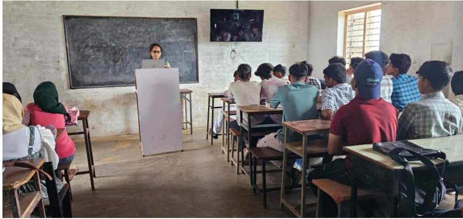
Induction Program For BSW Students