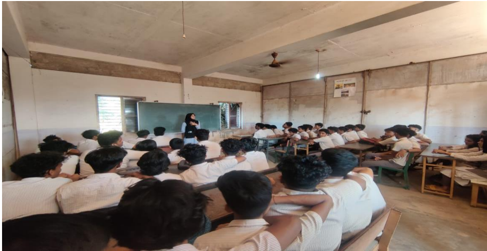
Consumer protection Act 1986 awareness class photo