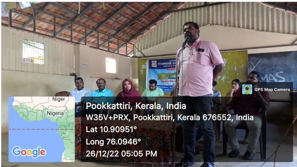
Awareness session on Neo-literacy to the students of the college