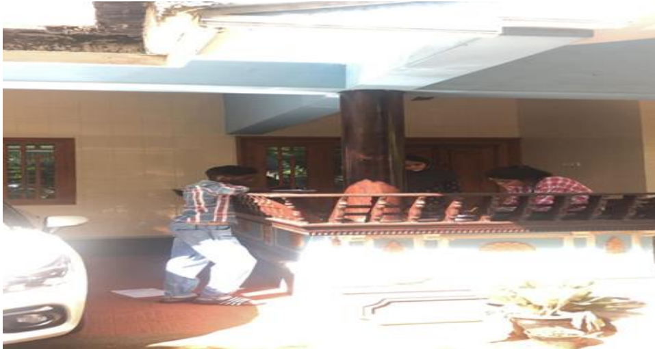
Literacy survey data collection