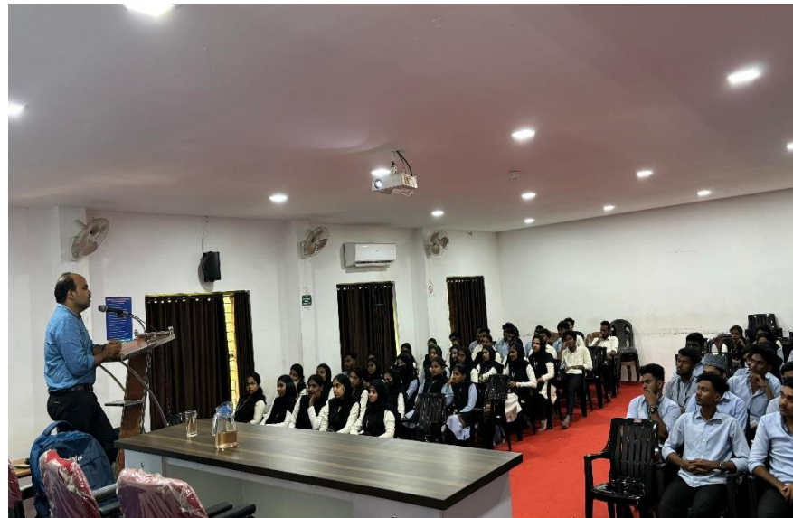
SEBI Workshop photos