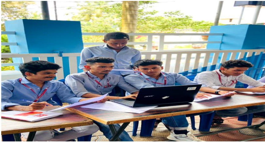
Voter ID and AADHAR Linkage camp photo