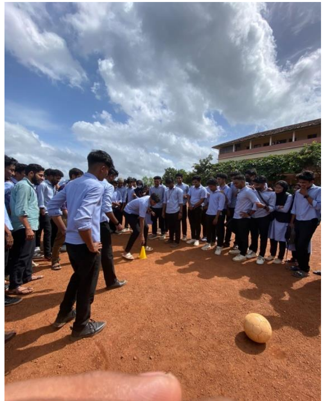
CARPE DIEM FIESTA photos