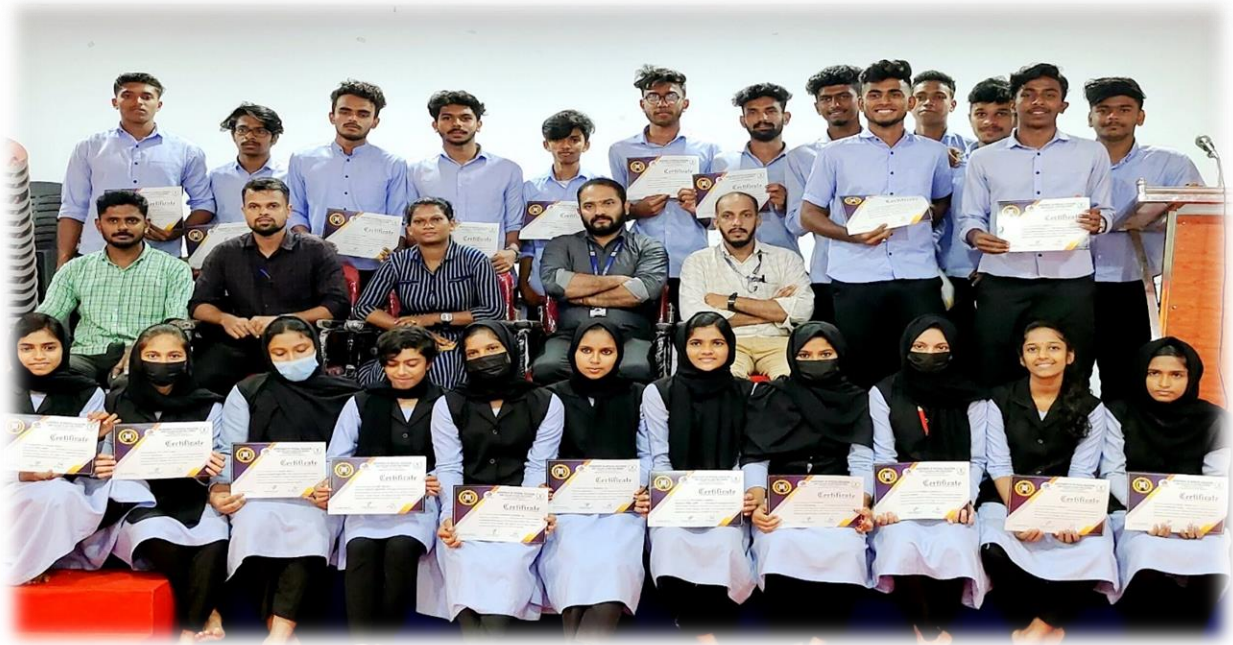
CERTIFICATE DISTRIBUTION OF 2021-22 CERTIFICATE COURSE