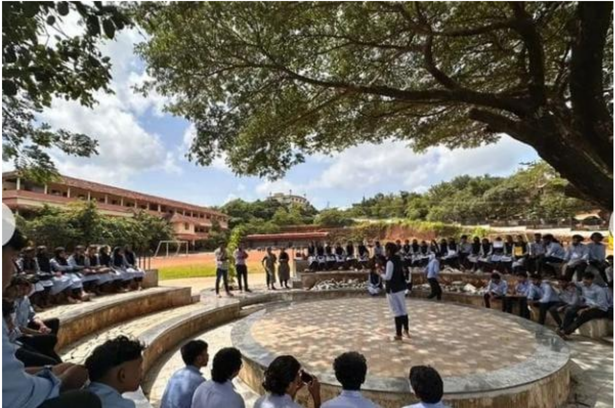
Gathering in the Amphitheatre