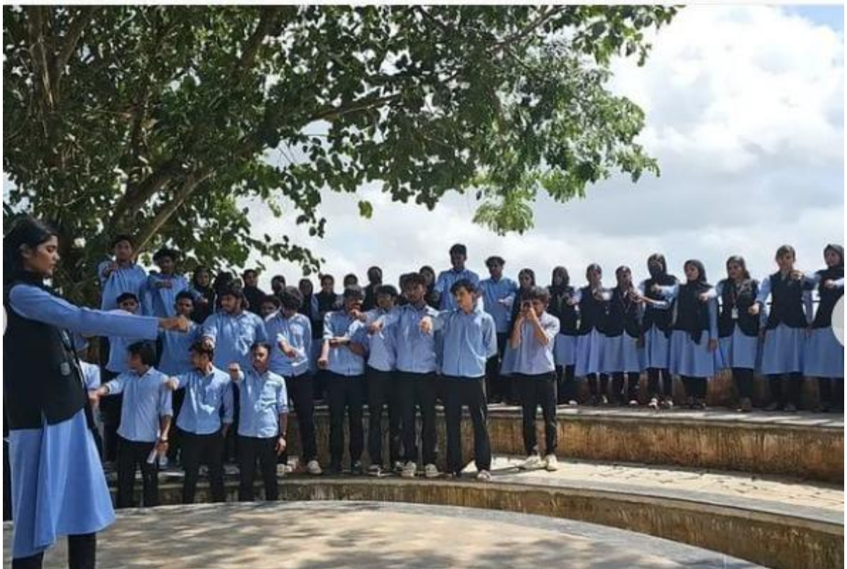
Students taking pledge to be part of gender sensitization