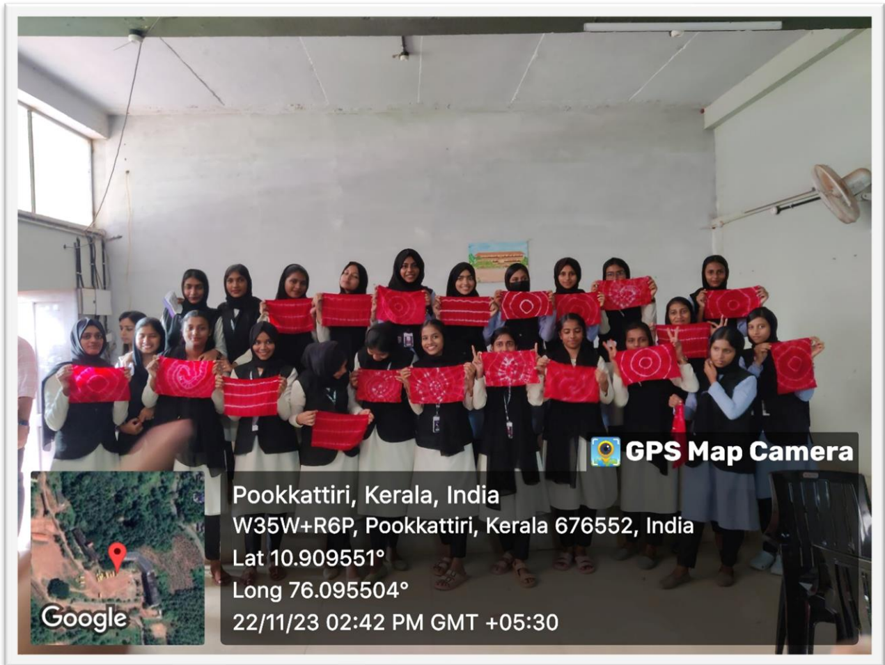
Students proudly display their vibrant creations at the Tie and Dye Workshop