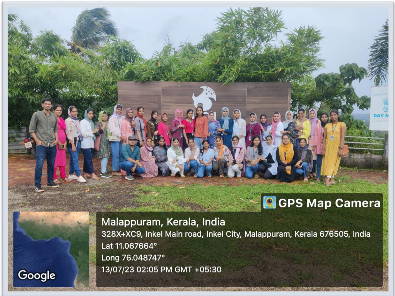
Girls' Team Visits Institute of Gems and Jewellery in Malappuram, Inkel City, Exploring Women Entrepreneurship