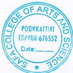
PRINCIPAL Safa College of Arts And Science Pookkattari, Edayur-676552