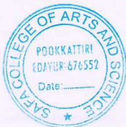
PRINCIPAL Safa College of Arts And Science Pookkattiri, Edayur-676552

4. Nomenclature of the Programme B A Foreign Trade has been changed as B A Economics with Foreign Trade with effect from 2019 Admission onwards vide UO read as (2).