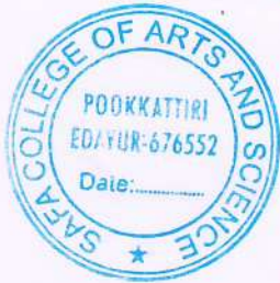
PRINCIPAL Safa College of Arts And Science Pookkattiri, Edayur-676552